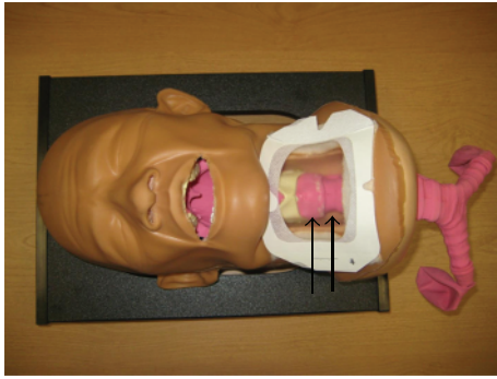
FIGURE 1: The thin arrow points to the cricothyroid membrane. The bold arrow points to the cricotracheal membrane.