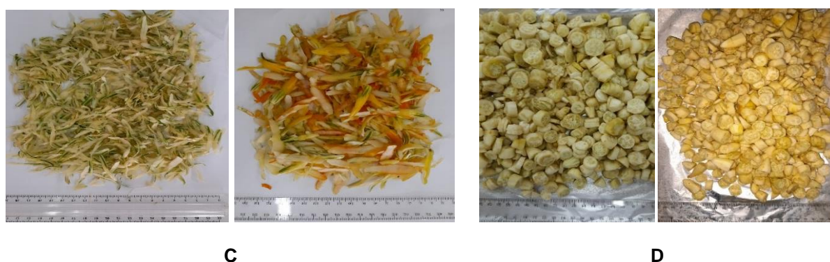
Fig. 1. African eggplant ( S. aethiopicum striped toga ); A: African eggplant matures (unripe); B: African eggplant (ripe); C: Cortex (unripe et ripe); D: pulp (unripe et ripe)