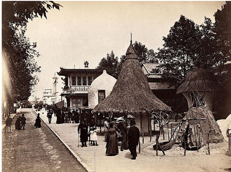
Fig. 1. Exposition Universelle de 1889 Habitation d’Afrique Centrale [France Exposition 1889 Houses in Central Africa] (S.n,1889) [55]

Anthropology, systematically studies the individual culture [10]. Due to the remote location and fabricated myths, Tibet became the most sought-after ethnographic subject matter which was predominantly based on the Western colonial lineage.