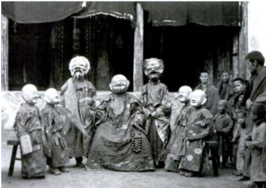
Fig. 7. Buddhist ritual at Choni, Gansu, China. Photography. [35,61]

Tibet held political importance to Britain, Sir Charles Alfred Bell KCIE CMG used to be the British political officer for the Himalayan regions, including Tibet [2, p. 77]. He encouraged the Dalai Lama to transform Tibetan territory into a strong and unified modern state, this positioned Tibet into a geo-strategic zone between Russia and China (ibid). British also put in efforts to transform Tibet into a legitimized nation-state and friendly neighbour to India, subsequently creating an India-Tibetan identity to separate from China (ibid). Therefore, Tibet started to necessitate its own art, creating national awareness, symbol, and consciousness of Tibet as a nation, such as by founding of Tibetan own football team and having competitions for Britain versus Tibet (Shakya, 2001, p. 78). In 1920, the British also encouraged schoolchildren in Gyantse to wear traditional Tibetan clothing (see Fig. 6) and presented photos of the Dalai Lama as competition prizes. This was to reinforce the supreme religious status of Dalai Lama, in addition, the British also strengthened its power in Tibet to resist China politically (ibid).