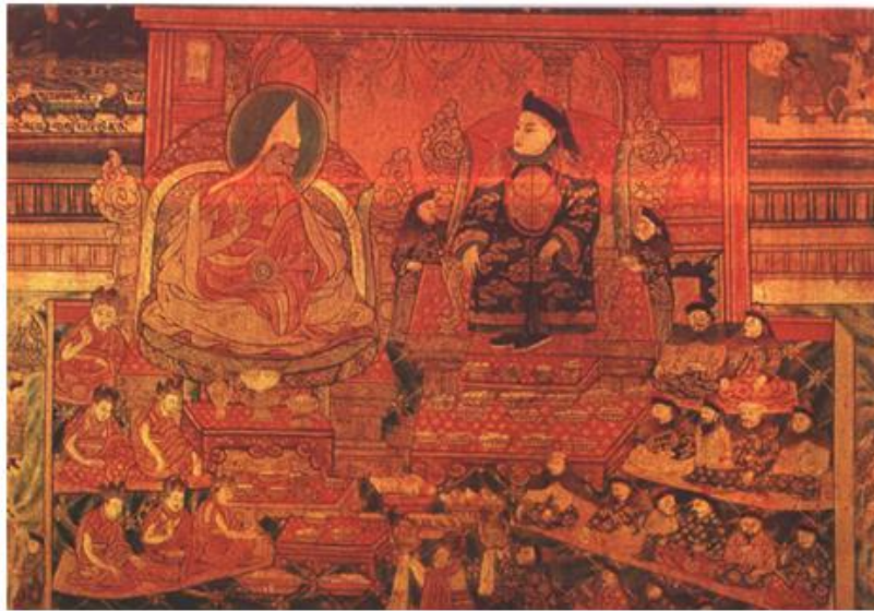
Fig. 10. Mural of Fifth Dalai Lama making obeisance to Ching Dynasty Emperor Shun Chih

CCP had clarified that due to the Japanese-China War during 1931-1941, and the Chinese Civil War between Kuomintang (KMT)-led government and CCP during 1927-1949 [44, p. 59], Tibet was not on the radar of CCP to reclaim its righteousness under China. Whereas in 1951, Chinese Chairman Mao Zedong signed the Tibet 17-point Agreement to reaffirm China's authority over Tibet with the support of 14th Dalai Lama then, however according to the Chinese account Dalai Lama did not keep his promise and was exiled to India to form the Government of Tibet in exile at the age of 23 [43, p. 36].