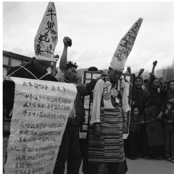
Fig. 12. Tibetan Civilians' Punishment during Cultural Revolution [47,66]

Tibet has been portrayed by China as a majority of them are slaves under the feudal hierarchy, they had been tortured by the 'superior' wealthy nobles under the system [2, p. 219]. The "Peaceful Liberation of Tibet" [45] freed the slaves of Tibet. This politicized Tibetan history had reiterated by Chinese officials, it has been instrumental in endorsing the political dominance over Tibet. Consequently, many establishments like the Tibet Museum had continued the legacy of accentuating the Chinese version of Tibetan history.