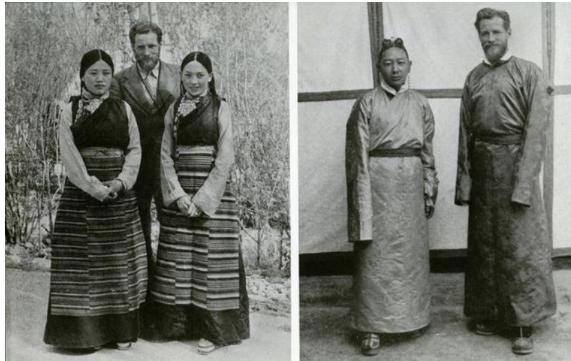
Fig. 8. Theos Bernard and Tibetan, Penthouse of the Gods (N.a, 1936) [62]