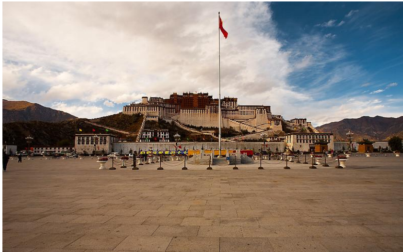
Fig. 13. Potala Pano (Lee, 2001) [67]

On the contrary, Potala Palace is seen as an essential factor to rebuild the image of Tibet in Chinese interest. During the 30th anniversary of the 'Liberation of Tibet', the Potala Square (Fig. 13) was constructed right in front of the Palace [2, p. 196], where a celebration performance at the Potala Square reminded the Tibetan community of the Chinese authority. Performances also highlighted that Tibetan is just another race among other 55 minority races in China, where Han Chinese is described as dominating father or elder brother figure (ibid). At the Potala Square, the Chinese Liberation Army (CLA) soldiers will patrol here every day, the Chinese national flag flies high in the middle to reinstate Chinese sovereignty. On the whole, CCP intended to normalise Tibet with other cities in China, musealising Lhasa city into a museum relic status for further political representations.