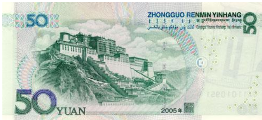
Fig. 14. 50 Chinese Yuan (Weber, 2010) [68]

the importance by the manifestation of Potala Palace which embodied its political image from CCP. The Chinese Government had begun the project by 'musealising' the whole of Lhasa city, where the Buddhist shrines were secularised and open to tourists, it also promoted the building of new Tibetan monasteries amassed on streets as replicas to promote the Tibetanness of Lhasa [49]. Infrastructure was developed to promote accessibility to Tibet, such as the Qinghai Tibet Railway was connected from Beijing to Lhasa in July 2006, it is described as a 'miracle railway' due to the technical difficulty, in bringing opportunities to remote Tibet (ibid). Mr. Hu Jintao, the president of China, then mentioned the significance of the railway to further unifying Tibet and China and open to tourism and trade (ibid). Meanwhile, the state-funded Tibet Museum had also started its construction together with the theme park- Snow City [2, p. 200]. The theme park consists of many 3-dimensional human effigies and ambience props to narrate the miserable lives of Tibetan slaves (ibid). It is intended to reiterate the feudalistic past of Tibetan hierarchical 'obsolescence' and 'repugnance' to recap that Tibet had surpassed the dark time due to the modern Chinese progression. The establishment of the Tibet Museum is positioned as a more neutral institution than the Snow City , however, it is curated specifically for the political interest of CCP.