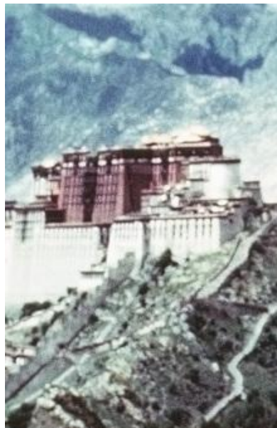
Fig. 9. Lowell Thomas: Tibet Lecture (Lowell, 1944) [63]

In comparison with the black and white photo perceived as factual, these colorised photos of Potala Palace appeared to be the enchanted 'fairy-tale' of Tibet. These photographs and films were eventually disseminated to the rest of the world, they were once the only critical source for people to know about Tibet visually. The fragmented and selective recording by British army photographers had limited its audience by the lack of contextual information and consequently resulted in the misrepresented impressions of Tibet.