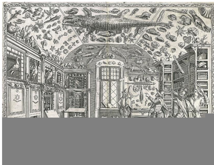
Fig. 3. Engraving from Ferrante Imperato's, Dell'Historia Naturale (Naples,1559) [57]