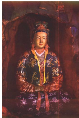
Fig. 11. Clay Carving Princess Wencheng in Potala Palace (Wang, 1995) [65]