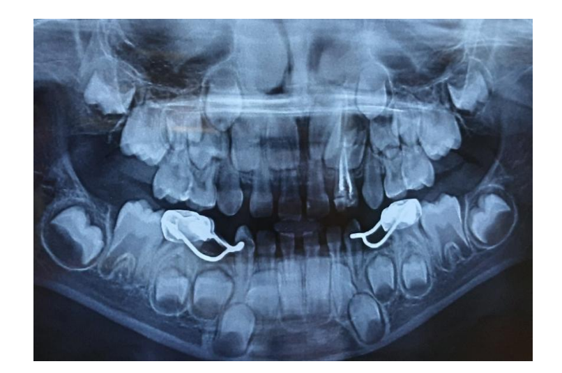
Fig. 15. Follow-up OPG showing successful treatment outcome and suspect gemination of 22