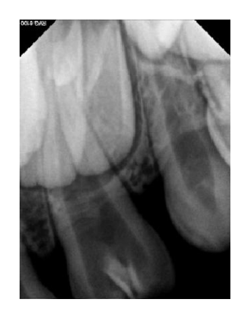
Fig. 5. Pre-operative IOPA of 62