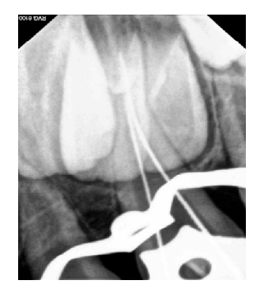
Fig. 9. Working length determination

Mechanical preparation of the canal was initiated with K-file number 15 and was carried out till size number 30 so as to ensure complete removal of the pulp and debris (until clean dentinal shavings) and facilitate complete obturation of the canal. A combination of a chelating agent i.e. EDTA (RC Help, India) and irrigants (1% Sodium hypochlorite, Normal saline) were used for the chemical preparation.