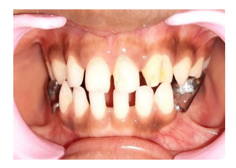
Fig. 11. Post-operative occlusion view

Tafti and Jawdekar; IJMPCR, 14(3): 6-14, 2021; Article no.IJMPCR.73281