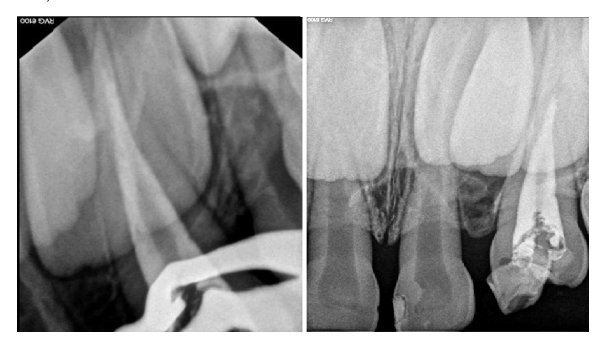
Fig. 10a. IOPA radiograph showing obturation of 62 with Metapex 10b. IOPA radiograph showing 22 showing gemination?

The child is advised further follow-up at 3 month intervals. The parents as well as the child appeared satisfied with the outcome of the treatment provided this far.