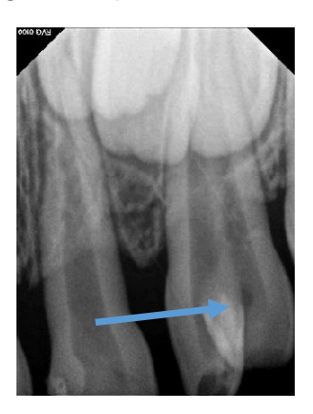
Fig. 6. Pre-operative IOPA of 62 and 22 (Arrow indicates radiolucency of caries suggestive of pulpal involvement)

According to Vertucci's classification (1974) the roots are Type VI and according to Weine's classification (1976) the roots are Type II [11]. Irregular ill-defined radiolucency was seen involving the enamel, dentine and pulp. Periapical region showed no abnormality.