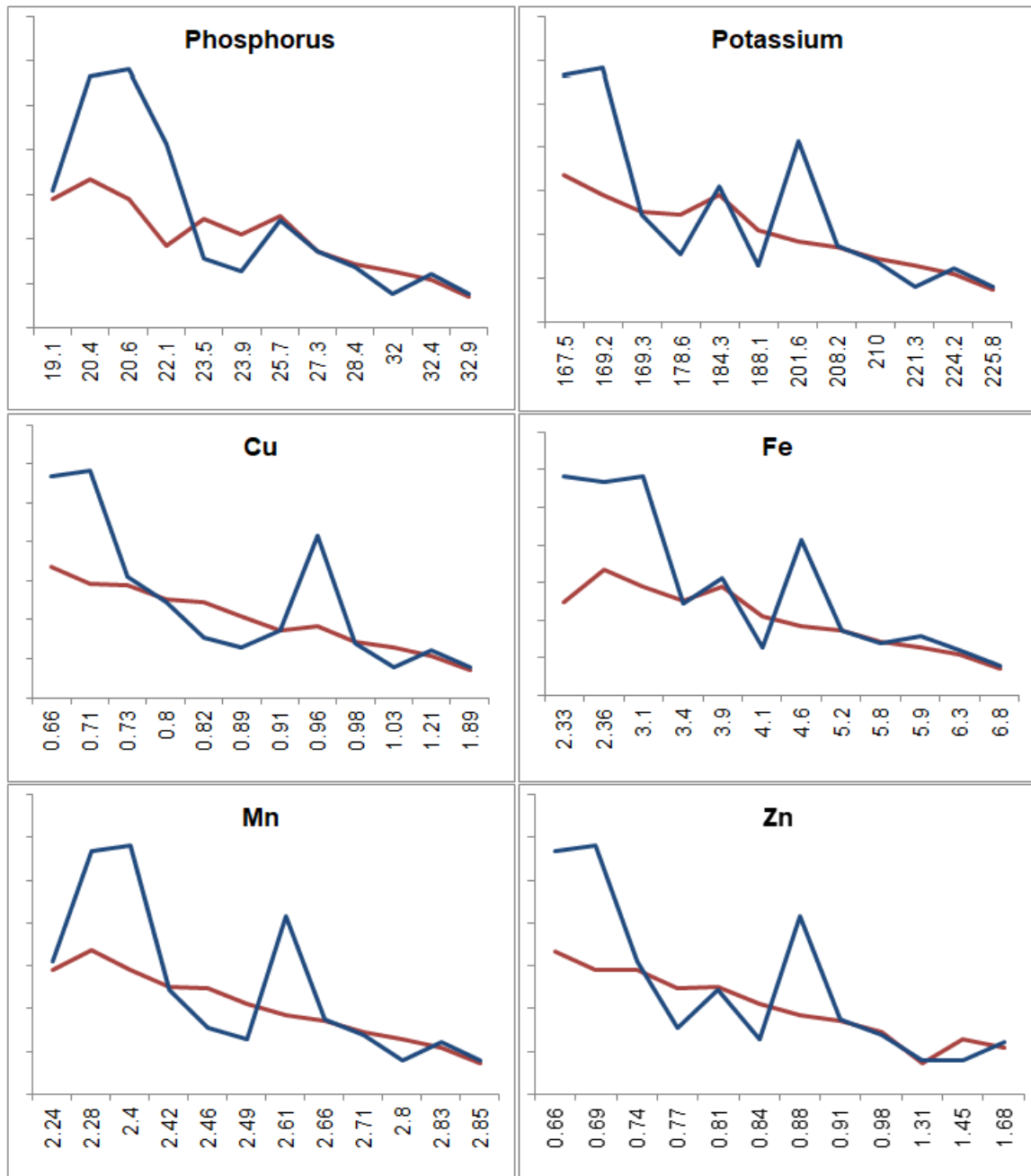
Fig. 3. Correlation between physico-chemical parameters of soil (Available P, K, Cu, Fe, Mn, Zn) and percentage mycorrhizal association and spore density (spore density is shown by the red line and root colonization by blue line. Physico-chemical parameters are taken on X-axis and spore density and % root colonization on Y-axis).

The results show that mean spore density and mean root colonization both have a significant positive correlation with soil pH. Spore density and root colonization of mycorrhiza are negatively correlated to soil Electrical conductivity (EC) which is not significant. Soil moisture is negatively correlated (non-significant) with spore density but positively correlated with