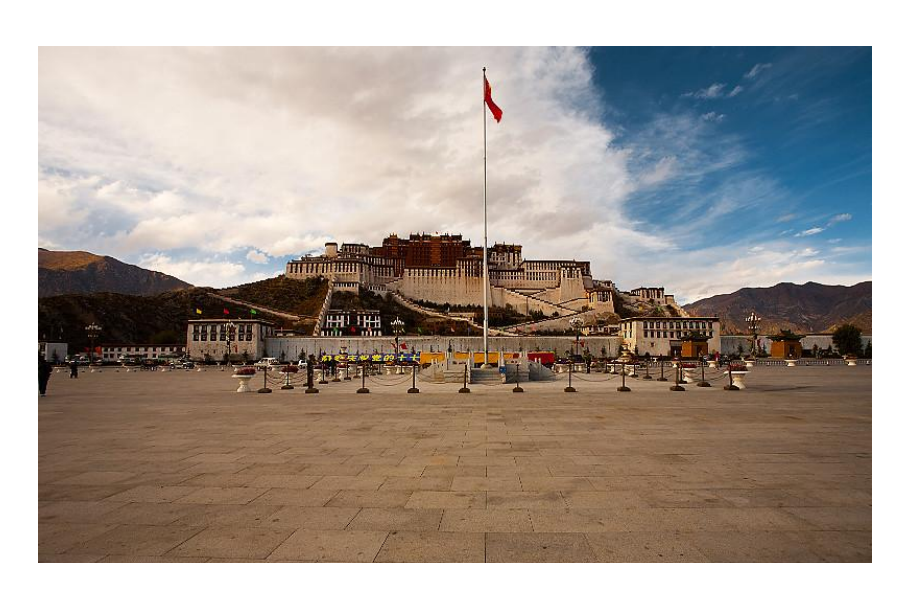
Fig. 13. Potala Pano (Lee, 2001) [67]

On the contrary, Potala Palace is seen as an essential factor to rebuild the image of Tibet in Chinese interest. During the 30th anniversary of the 'Liberation of Tibet', the Potala Square (Fig. 13) was constructed right in front of the Palace [2, p. 196], where a celebration performance at the Potala Square reminded the Tibetan community of the Chinese authority. Performances also highlighted that Tibetan is just another race among other 55 minority races in China, where Han Chinese is described as dominating father or elder brother figure (ibid). At the Potala Square, the Chinese Liberation Army (CLA) soldiers will patrol here every day, the Chinese national flag flies high in the middle to reinstate Chinese sovereignty. On the whole, CCP intended to normalise Tibet with other cities in China, musealising Lhasa city into a museum relic status for further political representations.