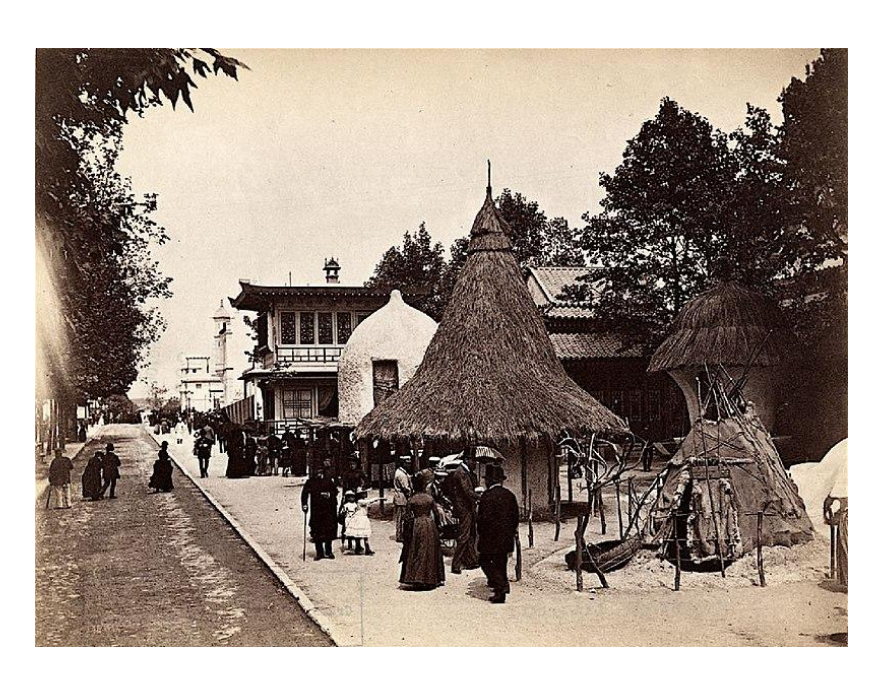
Fig. 1. Exposition Universelle de 1889 Habitation d'Afrique Centrale [France Exposition 1889 Houses in Central Africa] (S.n,1889) [55]

Anthropology, systematically studies the individual culture [10]. Due to the remote location and fabricated myths, Tibet became the most sought-after ethnographic subject matter which was predominantly based on the Western colonial lineage.