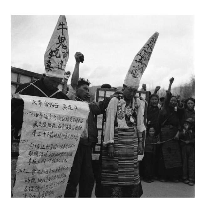
Fig. 12. Tibetan Civilians' Punishment during Cultural Revolution [47,66]

Tibet has been portrayed by China as a majority of them are slaves under the feudal hierarchy, they had been tortured by the 'superior' wealthy nobles under the system [2, p. 219]. The "Peaceful Liberation of Tibet" [45] freed the slaves of Tibet. This politicized Tibetan history had reiterated by Chinese officials, it has been instrumental in endorsing the political dominance over Tibet. Consequently, many establishments like the Tibet Museum had continued the legacy of accentuating the Chinese version of Tibetan history.