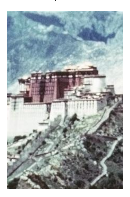
Fig. 9. Lowell Thomas: Tibet Lecture (Lowell, 1944) [63]

In comparison with the black and white photo perceived as factual, these colorised photos of Potala Palace appeared to be the enchanted 'fairy-tale' of Tibet. These photographs and films were eventually disseminated to the rest of the world, they were once the only critical source for people to know about Tibet visually. The fragmented and selective recording by British army photographers had limited its audience by the lack of contextual information and consequently resulted in the misrepresented impressions of Tibet.