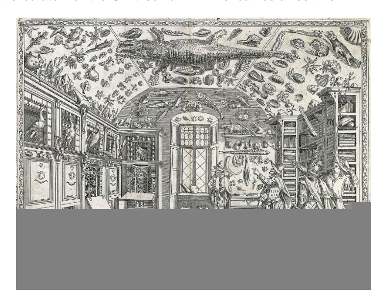
Fig. 3. Engraving from Ferrante Imperato's, Dell'Historia Naturale (Naples,1559) [57]