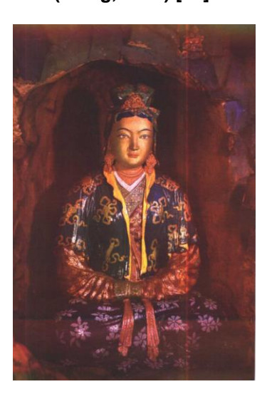
Fig. 11. Clay Carving Princess Wencheng in Potala Palace (Wang, 1995) [65]