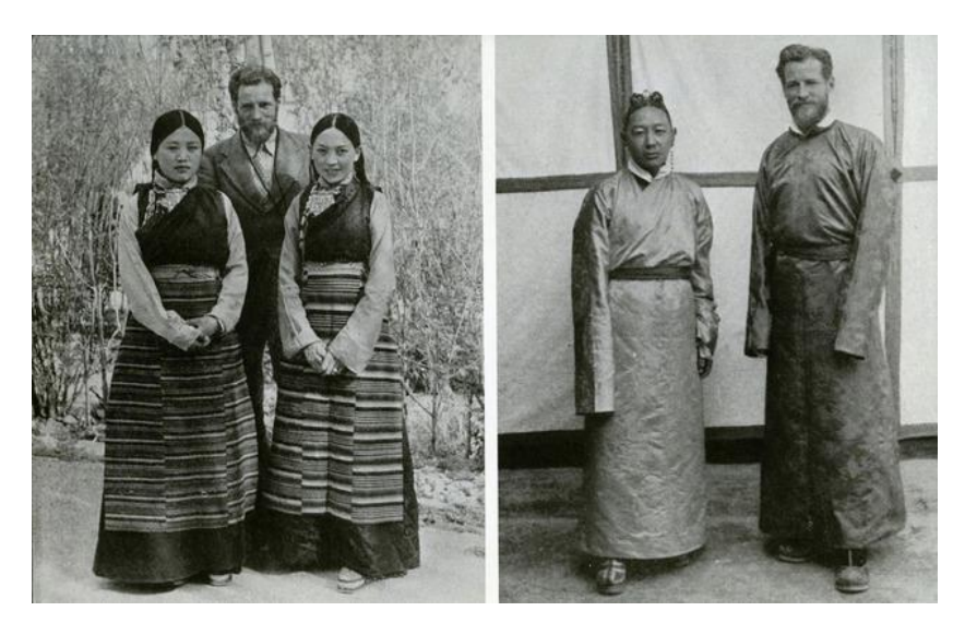
Fig. 8. Theos Bernard and Tibetan, Penthouse of the Gods (N.a, 1936) [62]