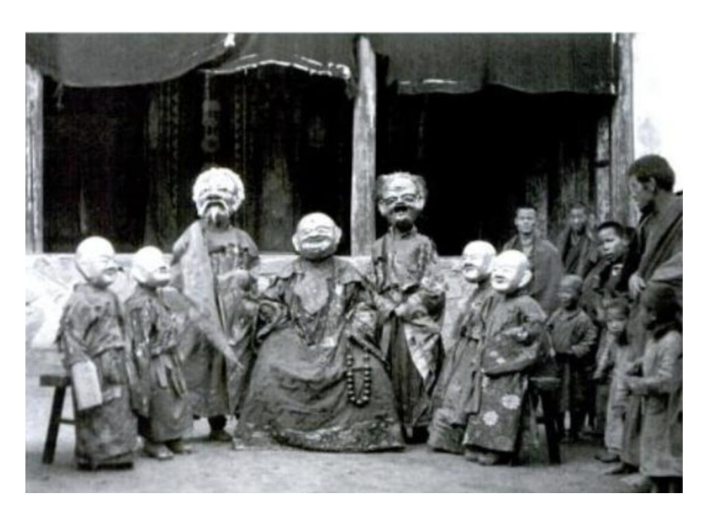
Fig. 7. Buddhist ritual at Choni, Gansu, China. Photography. [35,61]

Tibet held political importance to Britain, Sir Charles Alfred Bell KCIE CMG used to be the British political officer for the Himalayan regions, including Tibet [2, p. 77]. He encouraged the Dalai Lama to transform Tibetan territory into a strong and unified modern state, this positioned Tibet into a geo-strategic zone between Russia and China (ibid). British also put in efforts to transform Tibet into a legitimized nation-state and friendly neighbour to India, subsequently creating an India-Tibetan identity to separate from China (ibid). Therefore, Tibet started to necessitate its own art, creating national awareness, symbol, and consciousness of Tibet as a nation, such as by founding of Tibetan own football team and having competitions for Britain versus Tibet (Shakya, 2001, p. 78). In 1920, the British also encouraged schoolchildren in Gyantse to wear traditional Tibetan clothing (see Fig. 6) and presented photos of the Dalai Lama as competition prizes. This was to reinforce the supreme religious status of Dalai Lama, in addition, the British also strengthened its power in Tibet to resist China politically (ibid).