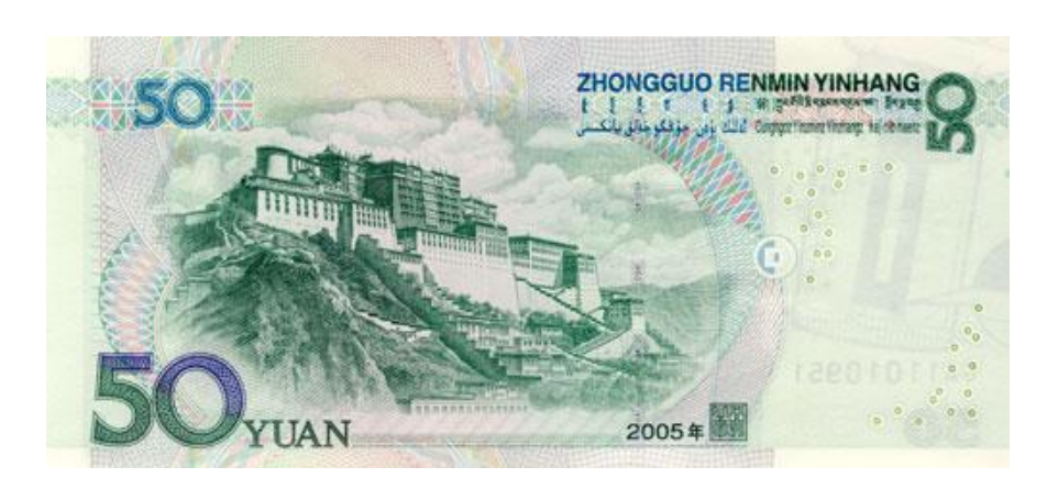
Fig. 14. 50 Chinese Yuan (Weber, 2010) [68]

the importance by the manifestation of Potala Palace which embodied its political image from CCP. The Chinese Government had begun the project by 'musealising' the whole of Lhasa city, where the Buddhist shrines were secularised and open to tourists, it also promoted the building of new Tibetan monasteries amassed on streets as replicas to promote the Tibetanness of Lhasa [49]. Infrastructure was developed to promote accessibility to Tibet, such as the Qinghai Tibet Railway was connected from Beijing to Lhasa in July 2006, it is described as a 'miracle railway' due to the technical difficulty, in bringing opportunities to remote Tibet (ibid), Mr. Hu Jintao. the president of China, then mentioned the significance of the railway to further unifying Tibet and China and open to tourism and trade Meanwhile, the state-funded (ibid). Museum had also started its construction together with the theme park- Snow City [2, p. 200]. The theme park consists of many 3dimensional human effigies and ambience props to narrate the miserable lives of Tibetan slaves (ibid). It is intended to reiterate the feudalistic past of Tibetan hierarchical 'obsolescence' and 'repugnance' to recap that Tibet had surpassed the dark time due to the modern Chinese progression. The establishment of the Tibet Museum is positioned as a more neutral institution than the Snow City, however, it is curated specifically for the political interest of CCP.