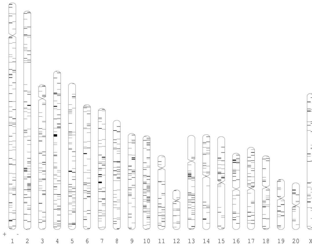
Fig. 1. mir-145 and mir-186 predicted targets gene targets distribution in the rat genome about strenuous exercise

Prcki is a kinase protein-coding gene involved in several biologic processes, playing important roles in metabolic pathways regulation. This gene has a part in cascade regulation events. Some examples of these are the Rap1 signaling pathway (rno04015), Endocytosis (rno04144), Hippo signaling pathway (rno04390), and insulin signaling (rno04910) [21].