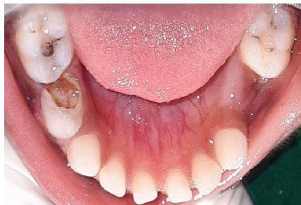
Fig. 4. Pre-operative view of mandibular arch