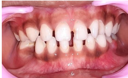
Fig. 1. Pre-operative view of teeth in occlusion

anomaly germination [Fig. 5]. The left maxillary permanent lateral incisor (22) also appeared to have a similar anomaly with an evident demarcation line on the crown of the tooth [Fig. 6].