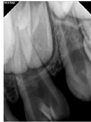
Fig. 5. Pre-operative IOPA of 62