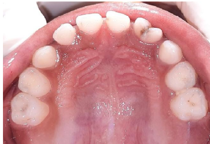
Fig. 3. Pre-operative view of maxillary arch