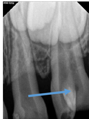
Fig. 6. Pre-operative IOPA of 62 and 22 (Arrow indicates radiolucency of caries suggestive of pulpal involvement)

According to Vertucci's classification (1974) the roots are Type VI and according to Weine's classification (1976) the roots are Type II [11]. Irregular ill-defined radiolucency was seen involving the enamel, dentine and pulp. Periapical region showed no abnormality.