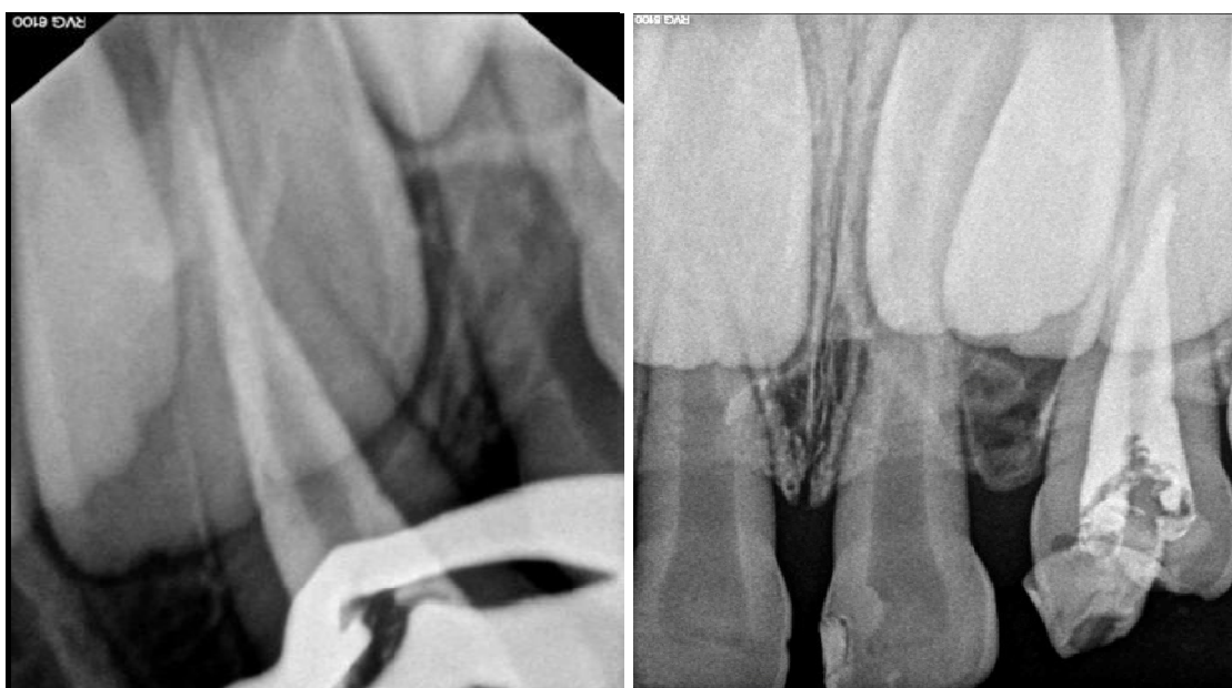
Fig. 10a. IOPA radiograph showing obturation of 62 with Metapex 10b. IOPA radiograph showing 22 showing gemination?

The child is advised further follow-up at 3 month intervals. The parents as well as the child appeared satisfied with the outcome of the treatment provided this far.