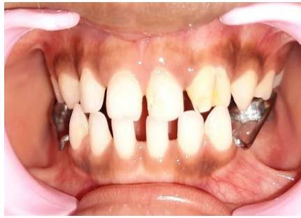
Fig. 11. Post-operative occlusion view