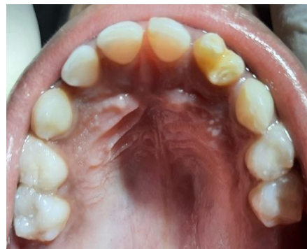
Fig. 13. Post-operative view of maxillary arch