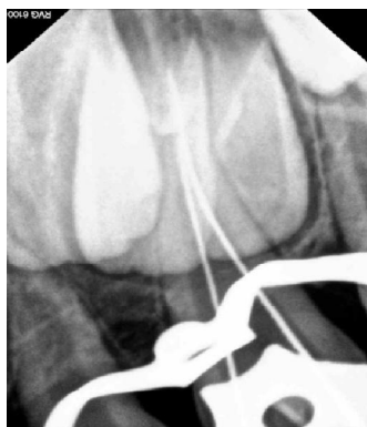
Fig. 9. Working length determination

Mechanical preparation of the canal was initiated with K-file number 15 and was carried out till size number 30 so as to ensure complete removal of the pulp and debris (until clean dentinal shavings) and facilitate complete obturation of the canal. A combination of a chelating agent i.e. EDTA (RC Help, India) and irrigants (1% Sodium hypochlorite, Normal saline) were used for the chemical preparation.