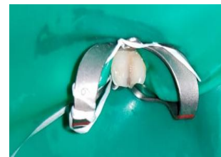
Fig. 8. Rubber dam placement