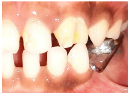
Fig. 12. Post-operative view of 62