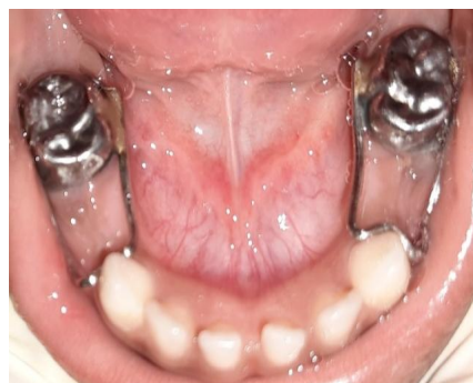
Fig. 14. Post-operative view of mandibular arch