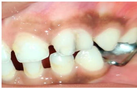
Fig. 2. Pre-operative view of 62