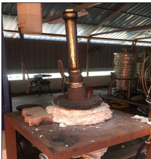
Fig. 1. Pyrolysis reactor for production of bio-oil

FTIR instrument indicates that the bio-oil consisted of oxygenated organic compounds; the functional group of samples was analyzed and measured by FTIR spectroscopy. This instrument also investigates and applies the structural changes of bio-oil as a function of different sample preparations (pre-treatment process). This research will perform FTIR using a Perkin Elmer Spectrum GX FTIR spectrometer with a wavelength of 4000– 400 cm -1 .