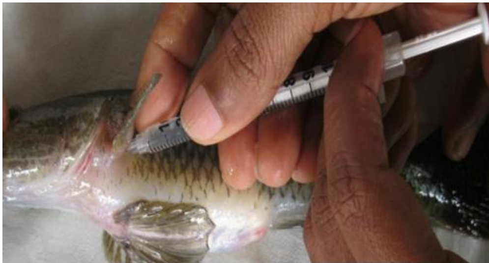
Fig. 2. Injecting PG extract to the female gobi ( G. giuris )

The male could not be stripped for the collection of milt. So, the testes from respective male were dissected out from its body cavity and were macerated in 0.85% NaCl solution. To affect and ensure fertilization, the sperm suspension was mixed with eggs by gently stirring with a feather (Fig. 4) and water was added to the egg-sperm mixture to activate the sperms for fertilizing the eggs. Fertilized eggs were then washed several times with clean water to remove the excess milt, blood etc.