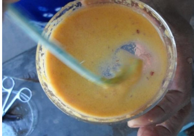
Fig. 4. Fertilization processes of eggs with sperms of gobi ( G. giuris )