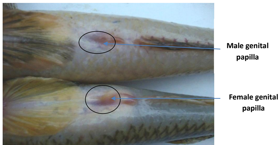
Fig. 1. Genital papillae of gravid male and female gobi ( G. giuris )