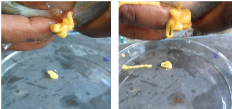
Fig. 3. Stripping of an ovulated female gobi ( G. giuris )