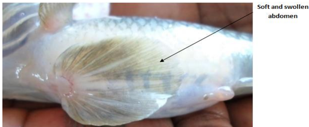
Fig. 5. Soft and swollen abdomen of female gobi ( G. giuris ) 6h post second injection of PG