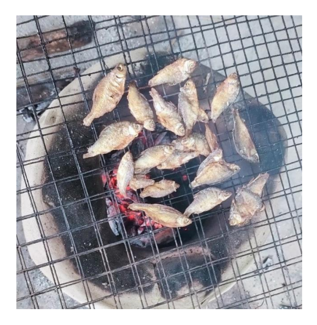
Fig. 1. Traditional smoked drying of fish ( P. sophore )

In the traditional smoked drying method (Fig. 1) fishes were dried in a smoking kiln, after cleaning without any pre-treatment such as salting or icing. Fishes were spread on a metal grill and directly exposed to smoke and heat that was produced below. The fishes were smoked for about 12 hours. Following smoking, sun-drying was carried out for 24 hours. The dried fish samples were kept in airtight glass containers and stored in a refrigerator.