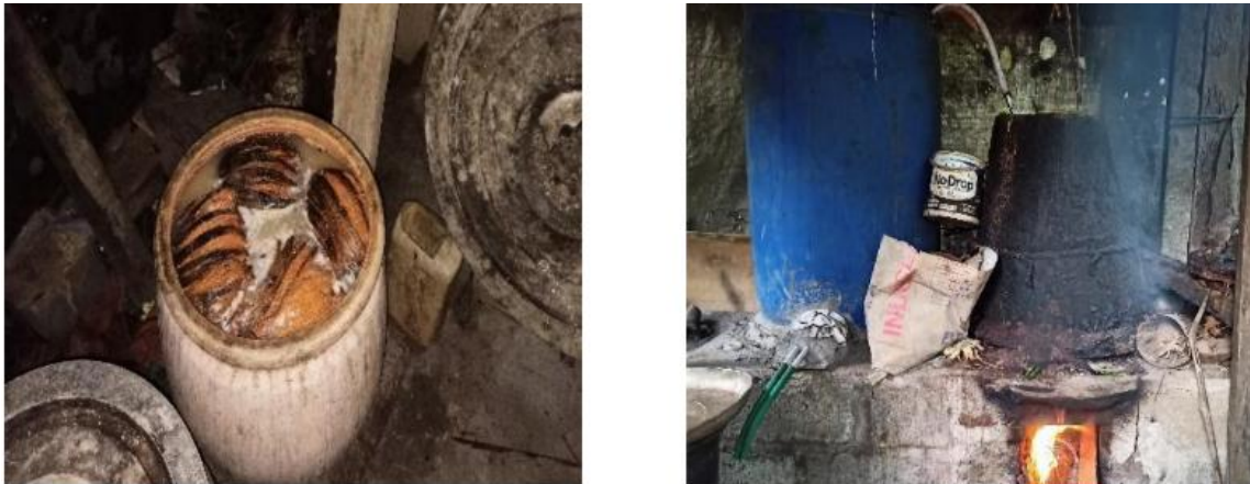
Fig. 2. Stages of Fermentation and Distillation of Coconut Nira into Arak Bali